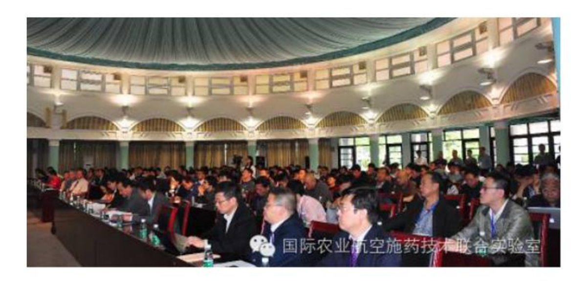
The 3<sup>rd</sup> International Conference of Precision Agricultural Aviation (College Station, Texas, USA, 2012)